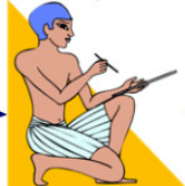
EARLY WORLD CIVILIZATIONS