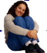
THE HUMAN BODY