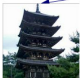
DIFFERENT LANDS, SIMILAR STORIES

____ Thematic Domains ____ Instructional Day ____ Minutes/Day