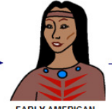
EARLY AMERICAN CIVILIZATIONS