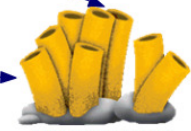
ANIMALS & HABITATS