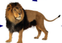
FABLES & STORIES